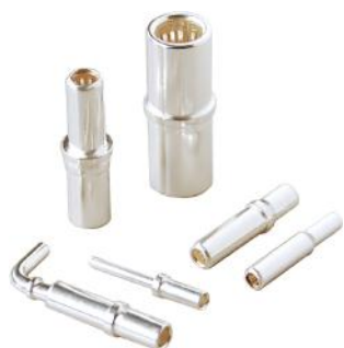
Socket pins (silver plating)