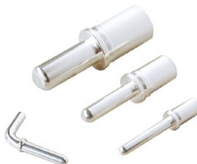
Plug pins (silver plating)